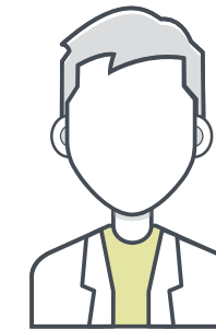
Plate handling takes up to 73% less operator time

That's why Esko re-engineered the flexo plate making process. We integrate plate imaging and front & back exposure in one solution.