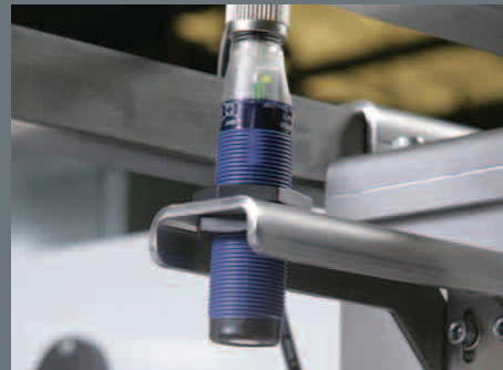
Sheet jam sensing system