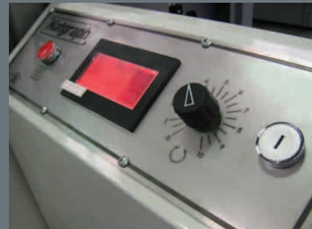
Touch Screen stacker control