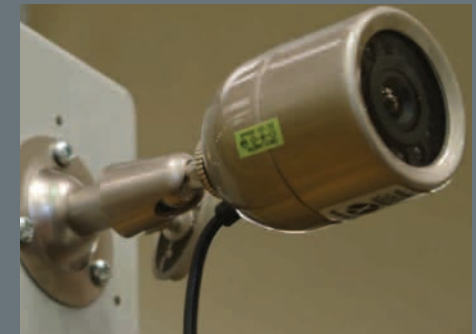
CCTV Stack Monitoring System